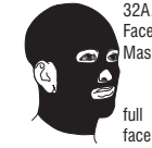
32A. Face Mask full face