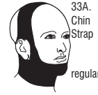
33A. Chin Strap regular