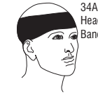
34A. Head Band