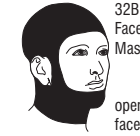
32B. Face Mask open face