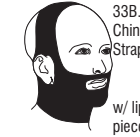
33B. Chin Strap w/ lip piece